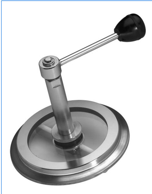
Sightglass for Triclamp fitting with built-in wiper, series WD