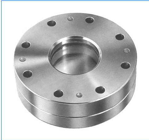
Double glazed safety sightglass similar to DIN 28121, DN 125, PN 10